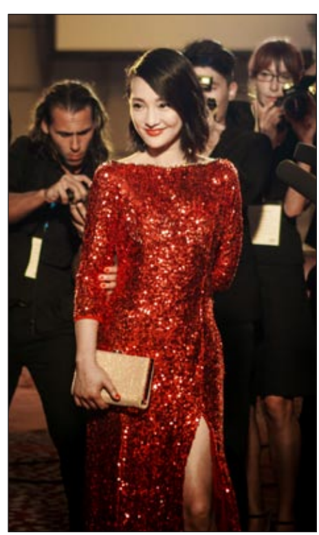
Zhou Xun stars in Ruyi's Love in the Palace

Are the two - fewer channels in Singapore and higher investment in Chinese content for global distribution connected?